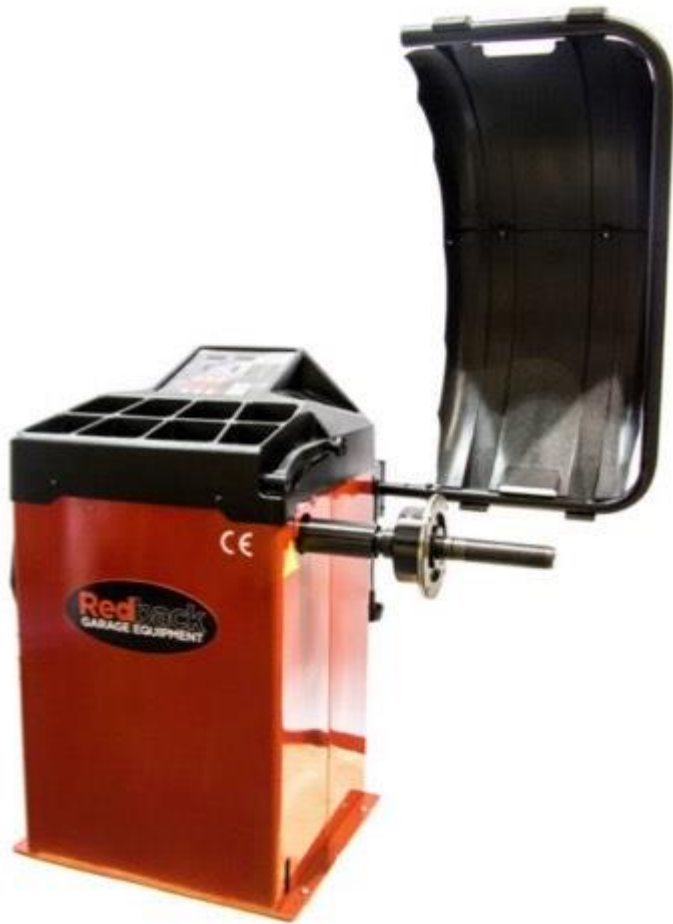
Redback 800 Dimensions

24" Manual Input Auto Spin Wheel Balancer